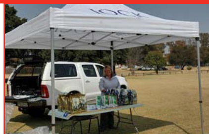
Our sponsors Afgri JOCK dog food.