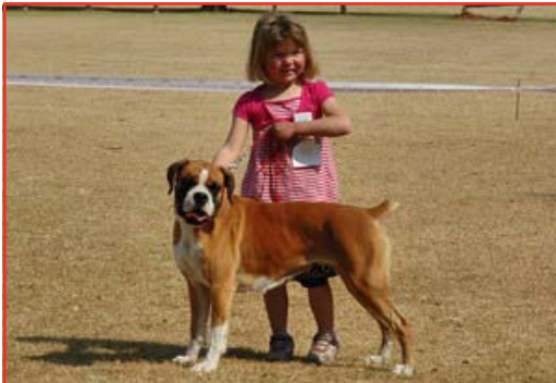
AJ and Flame in Child Handling