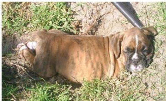
Working hard for you and your Boxer!