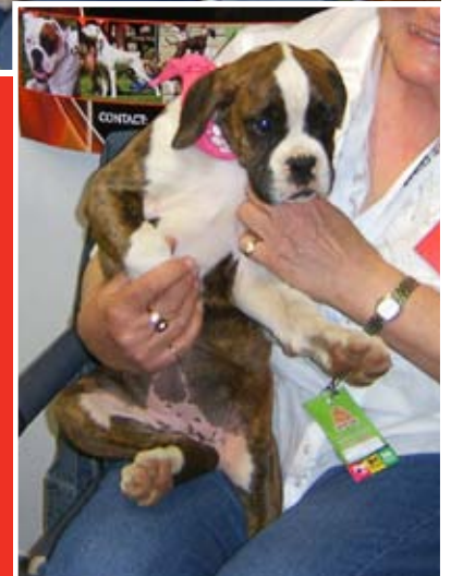
Top: Erna and Doo-Da Right: Wix looking a little worried by all the goings on!